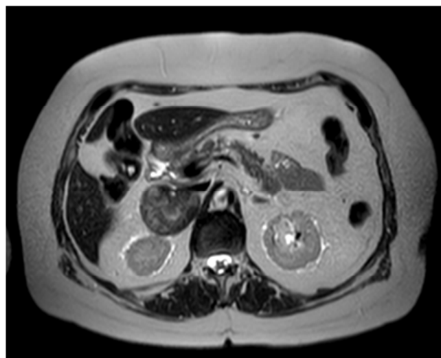
Figure 2: MRI showing BIBC metastases to right adrenal gland.