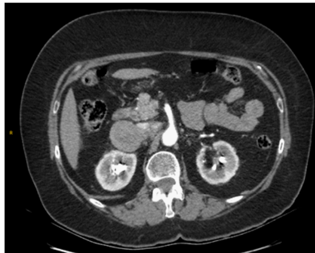
Figure 1: CT scan showing BIBC metastases to right adrenal gland.