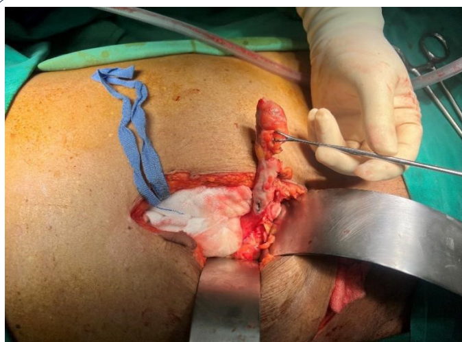
Figure 2: Lower midline laparotomy was performed, noted perforated appendix near its base.